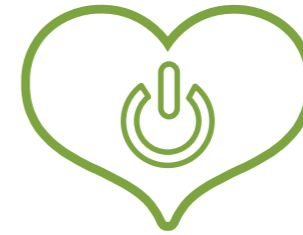
Energy & Transport