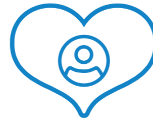
Young People & Skills