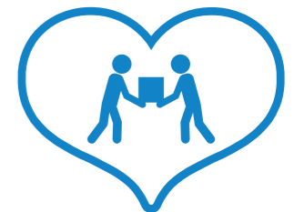
Health & Wellbeing