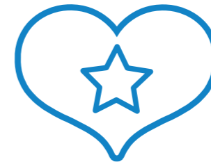
Inclusivity & Accessibility