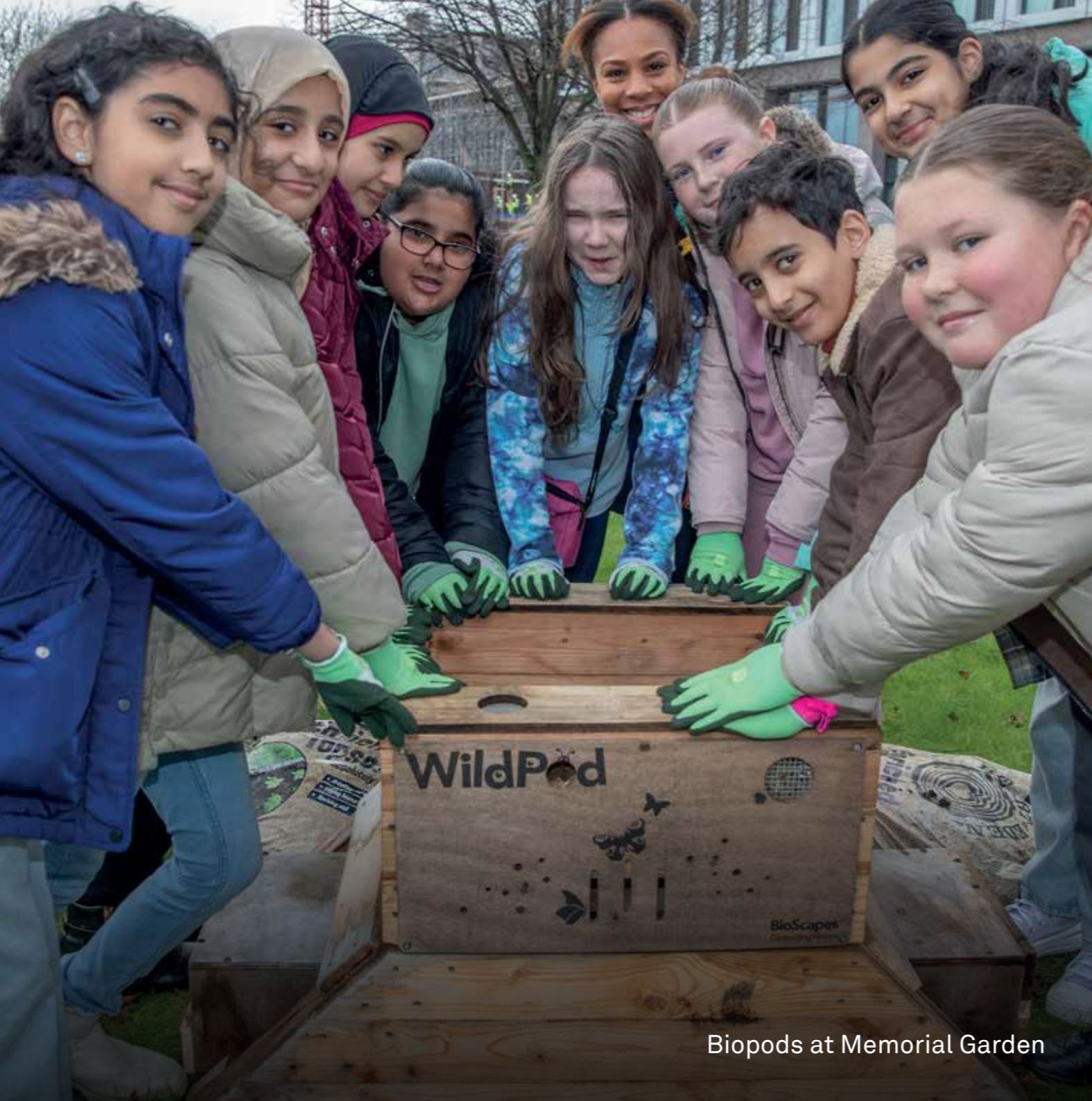
Biopods at Memorial Garden

The enhancements of St Thomas's Memorial Garden continued during 2024 with the display of a poetry display working with local schools, the installation of biopods and renewal of the flower beds.